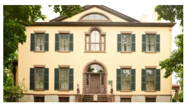
Seward House Museum Fellow abolitionists and suffragists, the Seward Family, opened their home to fleeing slaves as a safe resting place

Come join All In One Tours for this unique experience! October 9 – 17, 2023